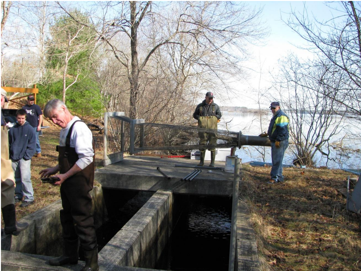
Wire Tunnel and Counting Tunnel ready for Installation, Snipatuit Pond