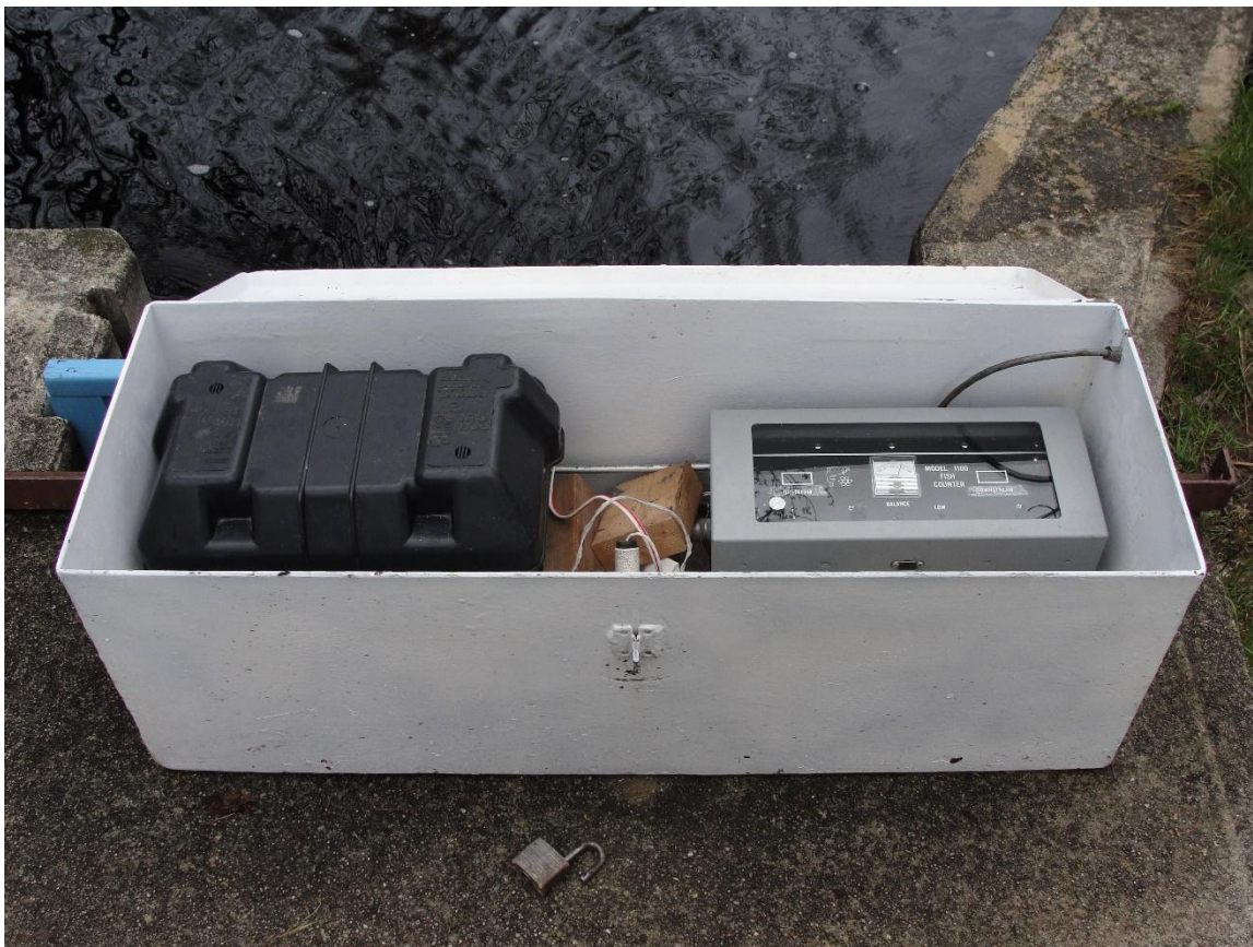
Smith-Root Model 1100 Electronic Fish Counter