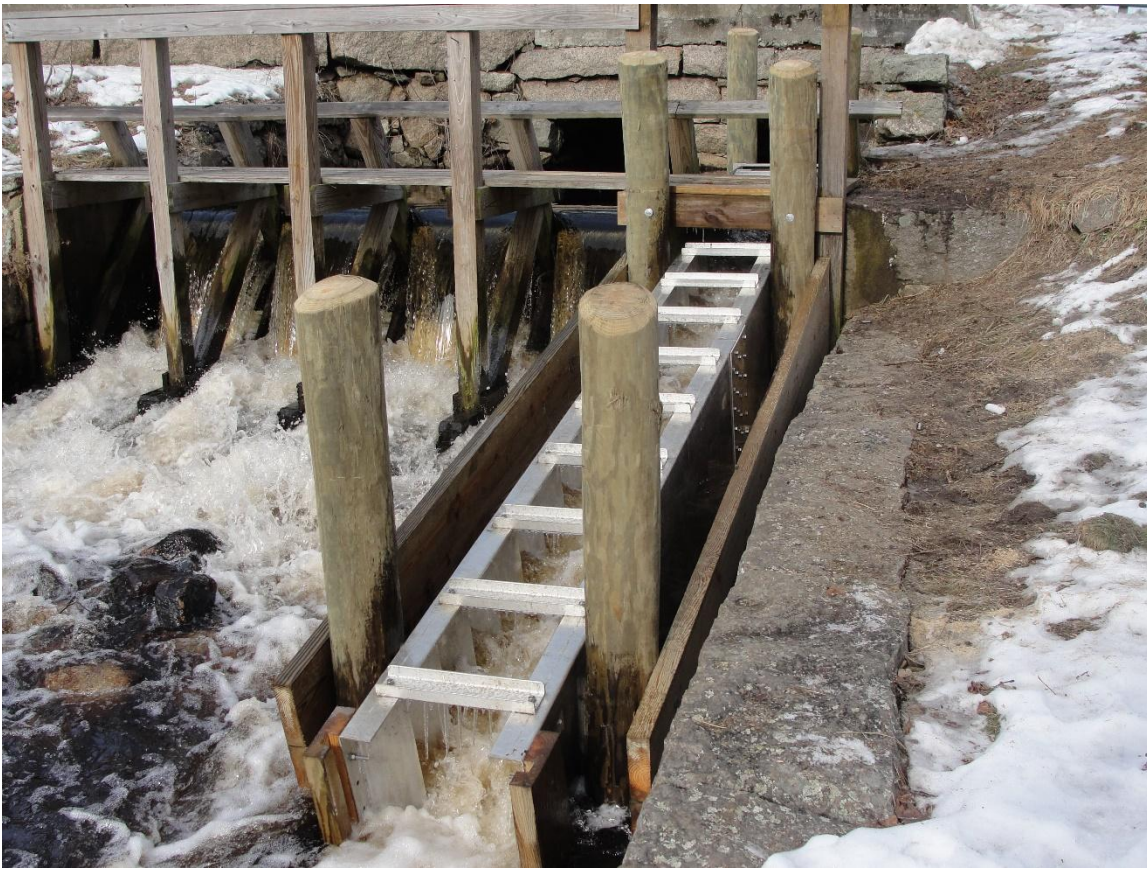
Leonard Pond Fish Ladder