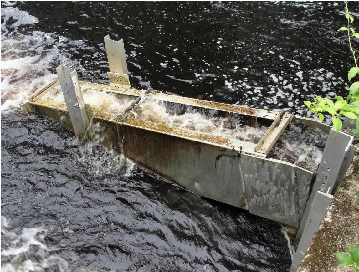
Hathaway Pond Fish Ladder

The second fish ladder, also in Rochester, is approximately two more miles upstream where the herring reach their destination and make the final transition from the Sippican River into Leonard's Pond (a 54 acre +/- man made pond) where they spawn. The original wooden Denil ladder built in 1993 by Massachusetts Division of Marine Fisheries using materials donated by Alewives Anonymous, Inc. was replaced in 2010 through a project led by the Town of Rochester, designed by Tibbetts Engineering Corp. and installed by Marine Tech Inc. with two ten foot sections of aluminum Alaskan steepspass ladder, also provided by the Massachusetts Division of Marine Fisheries. After several changes and adjustments, the ladder was operational for the Spring migration of herring starting in 2013. It facilitates the herring's transition from the river into the pond, an elevation difference of about four feet.