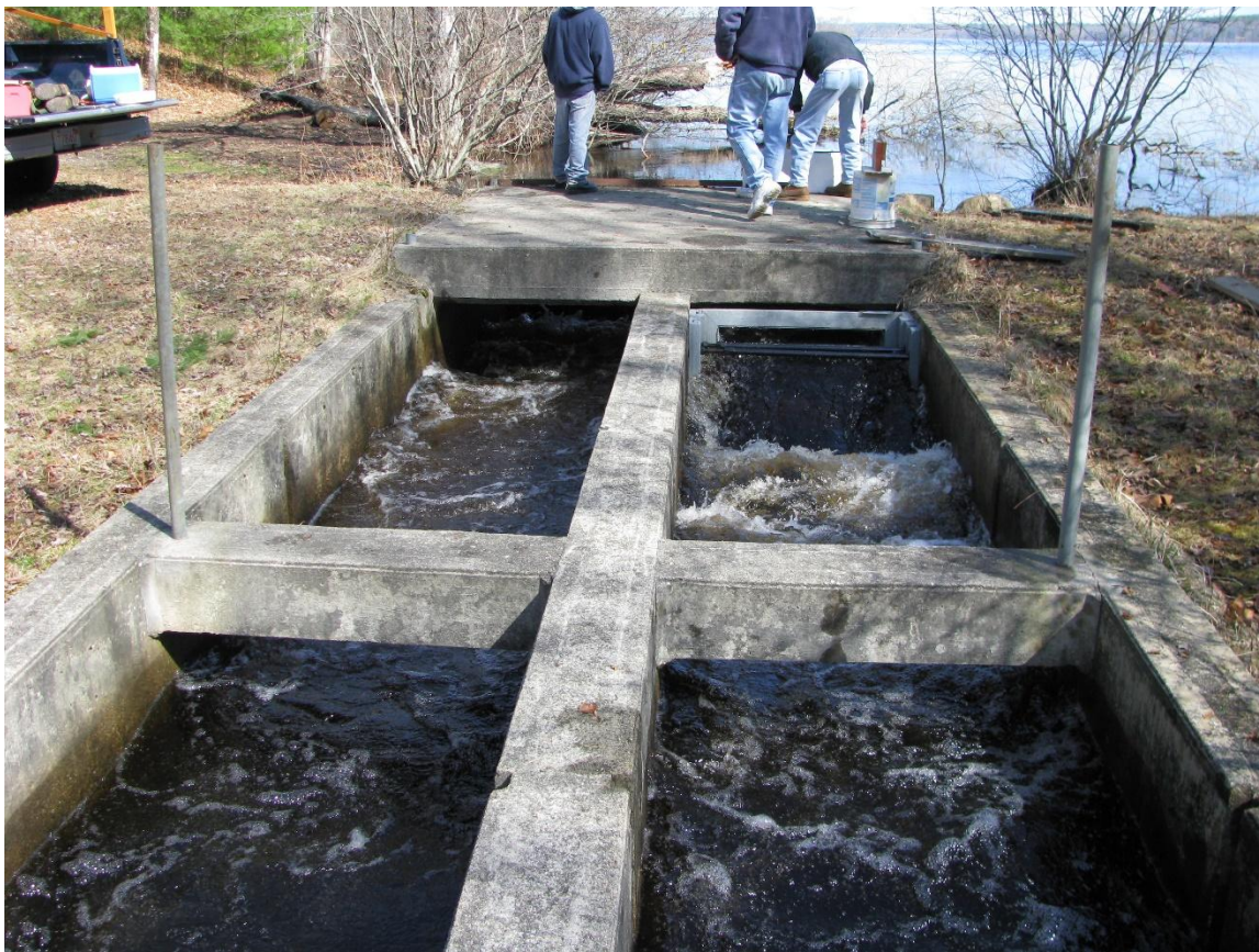
Ladder at the outlet of Snipatuit Pond

There are also two fish ladders on the Sippican River, which flows from Rochester to Marion, joining the Weweantic River before reaching Buzzards Bay.