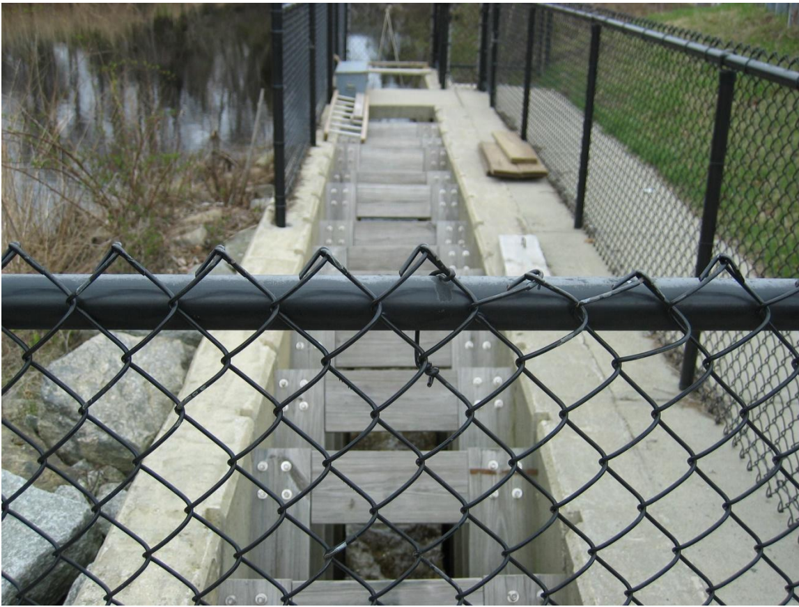
Ladder at Mattapoisett Herring Weir, Route 6.

The other ladder is in Rochester, approximately twelve miles upstream from the first ladder, at the headwaters of the Mattapoisett River where the herring reach their destination and make the final transition from the river into Snipatuit Pond (710 +/- acres) where they spawn. This ladder is a traditional concrete weir and pool fishway constructed by Massachusetts Division of Marine Fisheries for the herring to climb the two to three feet in elevation difference between the river and pond.