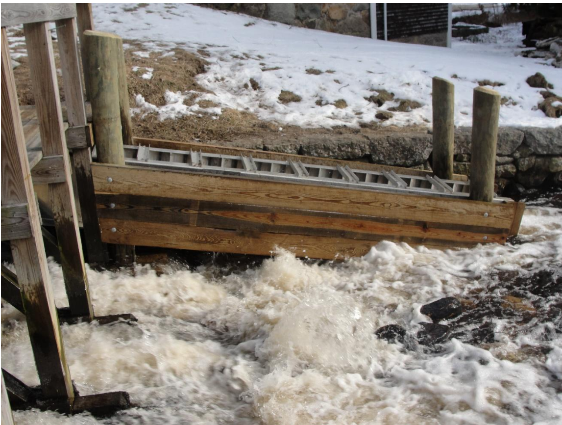
Leonard Pond Alaskan Steep Pass Ladder, 2011